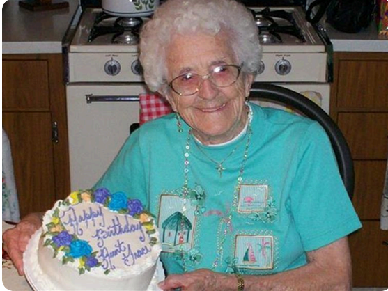
Happy 96th Birthday!